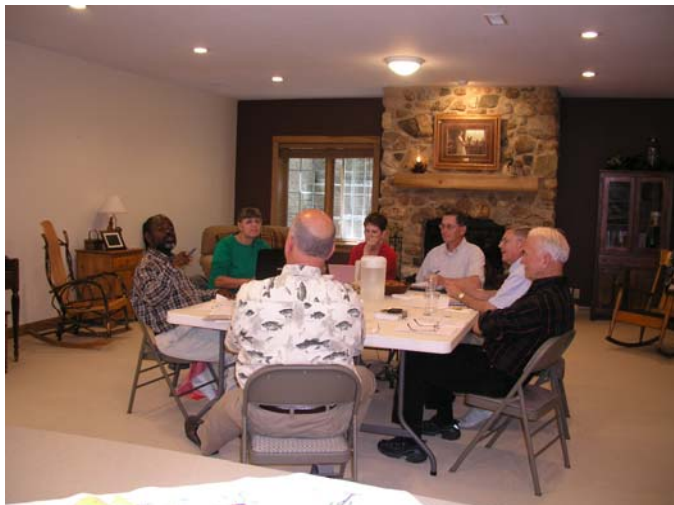
Members of the U.S. Board of Directors